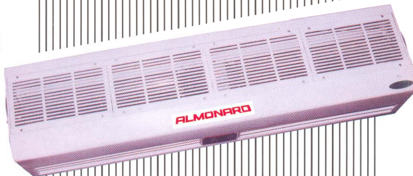
COMMERCIAL AIR CURTAINS